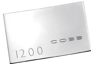
1 DWT SHEET SOLDER