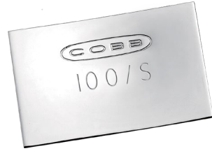
1 DWT SHEET SOLDER